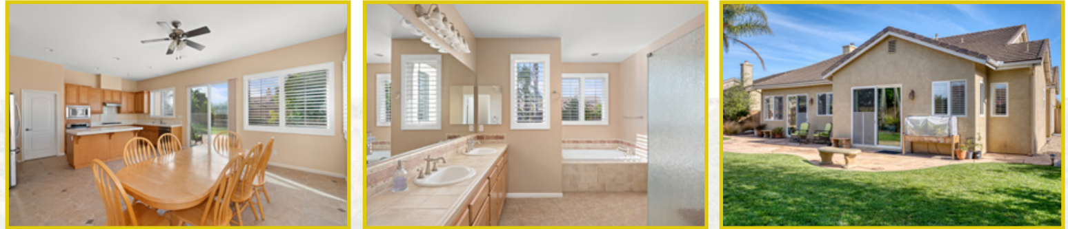
Kitchen & Dining Area

Lovely Bedrooms Including 4th Bedroom Option Or Den/Office, Another Bedroom With It's Own Personal Bathroom That Can Serve As Guest Quarters And A Romantic Master Suite With Sliding Door Access To Private Backyard & Luxurious Personal Bathroom.